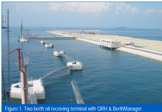
Figure 1. Two berth oil receiving terminal with QRH & BerthManager.

If remote release is incorporated, the hooks can be released from a remote location - generally the control room or jetty office - as well as by activating a button on the hook motor starter enclosure mounted on the rear of the hook. Local displays of the mooring load tensions and audible and visual alarms can also be incorporated into the hooks.