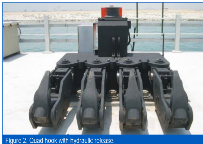
Figure 2. Quad hook with hydraulic release.