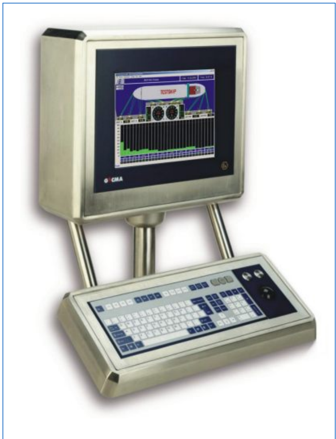
Figure 5. Zone 1 compliant pc.

The total order value is US $6 million, and there are a number of other projects pending.